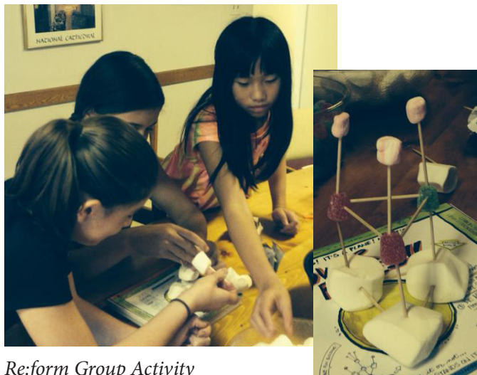
Re:form Group Activity