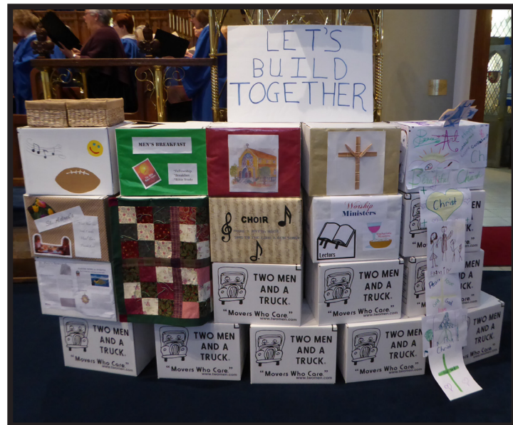
Boxes decorated by parishioners and representing Building Blocks of Ministry at St. Paul's.

Now, therefore, you are no longer strangers and foreigners, but fellow citizens with the saints and members of the household of God, having been built on a foundation of apostles and prophets, Jesus Christ Himself being the chief cornerstone in whom the whole building, being fitted together, grows into a holy temple in the Lord, in whom you also are being built together for a dwelling place of God in the Spirit. Ephesians 2:19-22