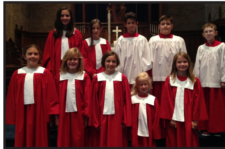
The contribution to worship of children's choirs is a long-standing tradition at St. Paul's, along with a valuable musical and Christ-centered education for choristers.

Will you continue in the apostles' teaching and fellowship, in the breaking of the bread, and in the prayers?