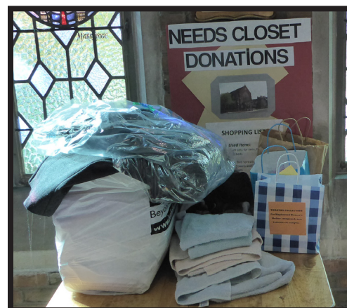
The Cloister Donation Table for the St. Paul's Personal Needs Closet, a Mission and Outreach project that serves those in need in the community, as do our Food Bank collections and Thanksgiving Baskets.