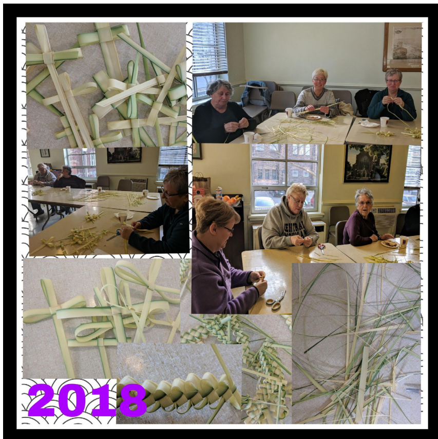
The Altar Guild makes Crosses for Palm Sunday