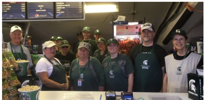
The MSU Concessions team at the first game of the season

... the ushers and Altar Guild who gave of their time to ensure the Diocese of Western Michigan had a great Diocesan Convention Eucharist at St. Paul's. Thank you! You did us proud and you created a great space for their worship.